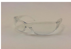
Anti-Fog Glasses $2.09 ea