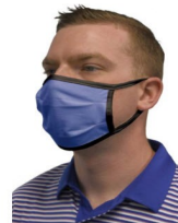
Cotton Facemask $5.90 ea