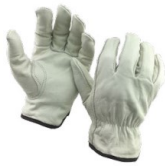
Gen Purpose Gloves $4.07 ea