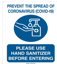
Hand Wash Signage Call