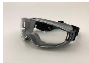
Lightweight Goggles $9.99 ea