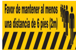
Multilingual Warnings Call