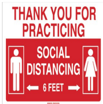
Social Distance Signage Call