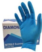
3 Mil Nitrile Gloves Call