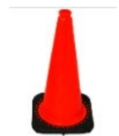
Wide Body Cone $8.28 ea