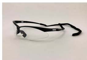
Neck Cord Glasses $4.29 ea