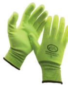
Polyurethane Palm Gloves $1.71 ea