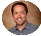
Tony Curtis Current Home Technologies