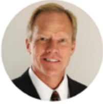
Paul Harris 17th District State Representative Pos. 2