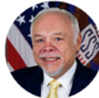
Don Benton District 5 Clark County Council